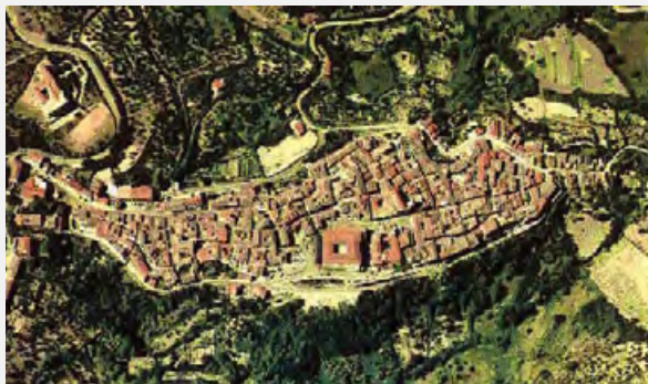
An aerial view of Larino shows its bird wing shape.

Tra i luoghi interessanti da vedere c'è il municipio, già villa dei signori Carafa e Sangro, con un orologio solare proveniente da rovine romane. All'interno si trovano anche lapidi e mosaici