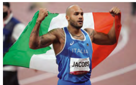
Lamont Marcell Jacobs celebrates his victory win the men's 100-meter sprint..

Lamont Marcell Jacobs on August 1 stunned the track community when he took the gold medal in the prestigious men's 100-meter sprint. Jacobs became the first Italian ever to win a medal in an event long dominated by athletes from the United States and, more recently, Jamaica. Jacobs was born in El Paso, Texas, to