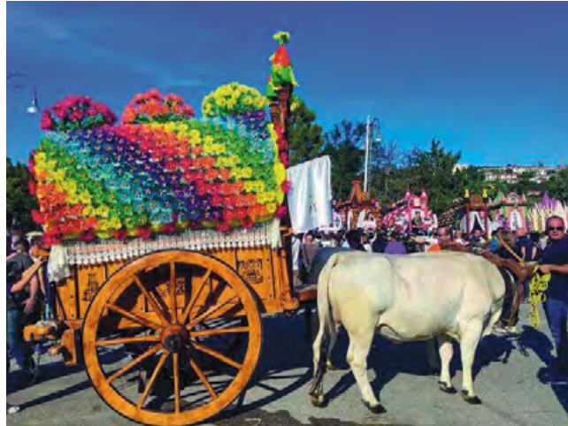
A colorful cart in the San Pardo procession.

Among the interesting sights to see is the town hall, previously the villa of the Carafa and Sangro lords, with a solar clock from the Roman ruins. Inside are also found Roman tombstones