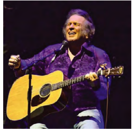
Don McLean in 2018.