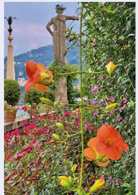
A garden in Isola Bella overlooking Lago Maggiore.