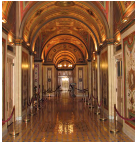
The corridors of the U.S. Capitol designed by Constantino Brumidi.

We are certain his talk will be interesting and informative, so please come and bring your family and friends. There will be a catered lunch by Fontina Grille along with some wonderful raffle prizes. This event is coordinated with the Casa Italiana Socio-cultural Center and the Italian American Museum of Washington, D.C. Reservations are due by September 28, 2021, and space may be limited, so please reserve early. For more information, see page 15. ■