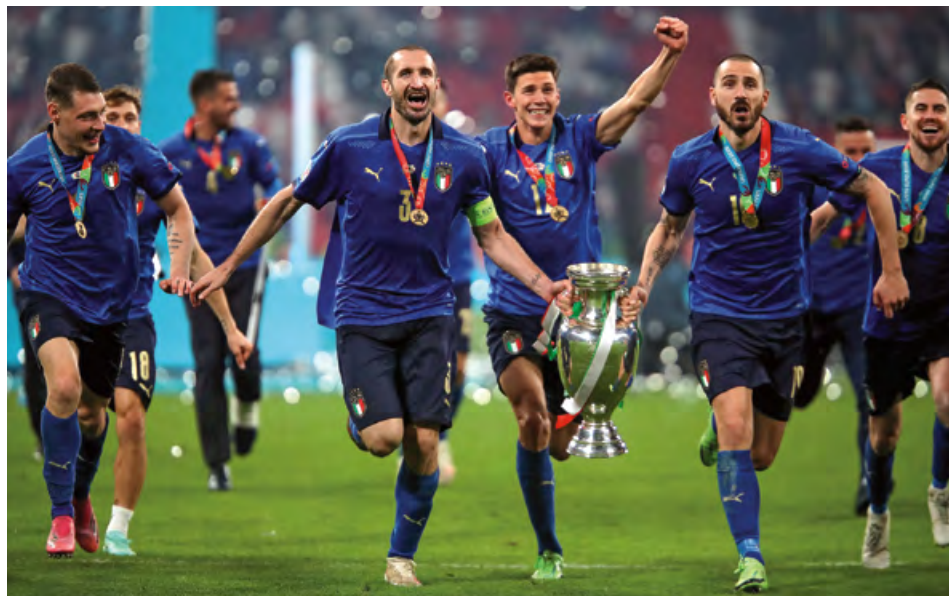
Italy's captain Giorgio Chellini (2nd from left holding cup) led his teammates in celebrating their Euro 2020 triumph.