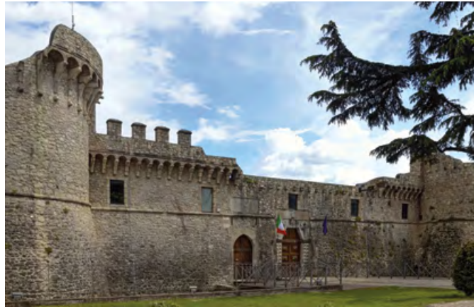
Castello Orsini Colonna

The city was literally toppled from the shaking and only one high-rise building survived. The earthquake, which measured 6.7 on the Richter scale, caused widespread damage over a large area of central and southern Italy. In Rome, St John's Lateran reported one fallen statue and there were even cracks in the Column of Marcus Aurelius.