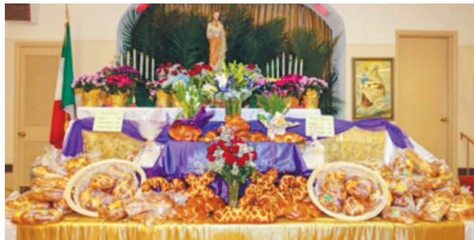
St. Joseph's Table

The celebration takes place on or close to St. Joseph's feast day of March 19 and represents hospitality and nurturing in the making and fulfill-