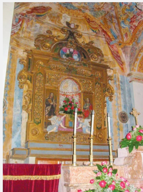
Chiesa della Madonna di Loreto

Ai visitatori si raccomanda di non mancare di visitare la Rocca, non distante dal centro abitato. La rocca, parte delle rovine di un castello distrutto da un terremoto, offre ai visitatori una bellissima vista della vallata del Biferno. Nel