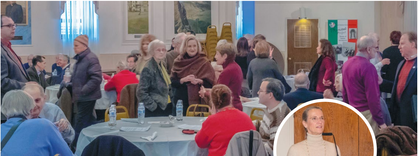
AMHS members and friends gather before the start of the well attended January meeting