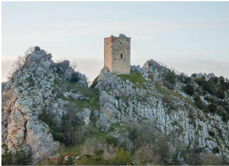
La Rocca di Oratino with its square tower

Among the places in Oratino which are well worth seeing are the Palazzo Giordano built as a fortified castle in the 14th century; the Church