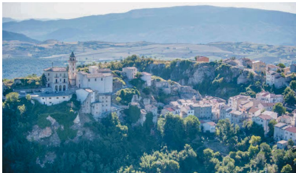
Panoramic views of Montenerodomo

A visit to Montenerodomo should include a trip to nearby Juvavum, an important archaeologi-