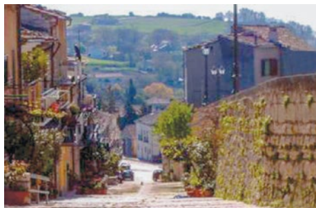
A street view from Oratino

Move) with Penelope Cruz in Molise and in one scene of traveling by car, you can see the fortress. (Note: Penélope Cruz learned Italian for the role, earned critical acclaim for her performance and won the David di Donatello award). ■