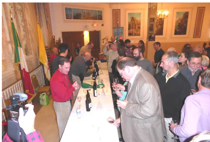
The 2017 wine tasting event