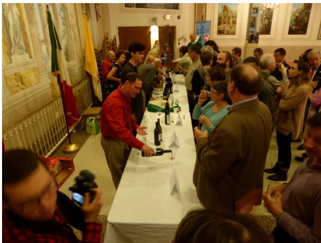
2017 Wine Tasting Event