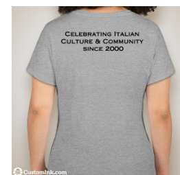
AMHS Women's T-Shirt

Material: 60% cotton/40% polyester. Sizes: S/M/L/XL Price: $20 + $4.50 postage and handling