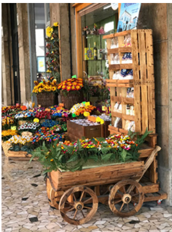
Confetti display in Sulmona