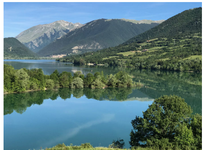
Lago di Barrea

Shortly thereafter, Joe struck up a conversation with some friendly gentlemen sitting on a bench along one of the streets. They were happy to share their views on life and the world situation! We visited several churches and found in one an unexpected delight: a stunning mechanical presepio , or nativity scene, complete with running water, depicting the village of Scanno and its villagers, wearing the traditional dress, engaged in daily functions, such as weaving, carpentry, and cooking.