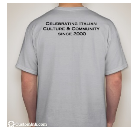
AMHS Men's T-Shirt

Material: 50% cotton/50% polyester. Sizes: S/M/L/XL Price: $20 + $4.50 postage and handling