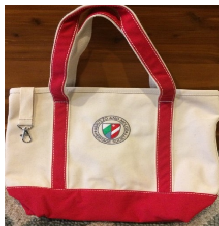
AMHS logo Tote Bag

Material: 60% cotton/40% polyester. Sizes: S/M/L/XL Price: $20 + $4.50 postage and handling