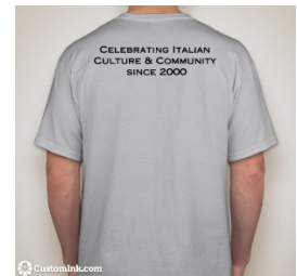
AMHS Men's T-Shirt

Material: 50% cotton/50% polyester. Sizes: S/M/L/XL Price: $25 + $4.50 postage and handling