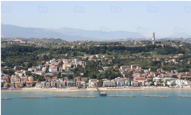
Francavilla al Mare

Francavilla al Mare is a beautiful area inhabited since prehistoric days which is now part of the urban area of Pescara. Located a few miles south of Pescara, it is one of the finest seaside resorts and an important cultural center in Abruzzo. It counts approximately 23,879 inhabitants, known as Francavillesi.