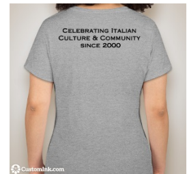
AMHS Women's T-Shirt

Material: 60% cotton/40% polyester. Sizes: S/M/L/XL Price: $25 + $4.50 postage and handling.