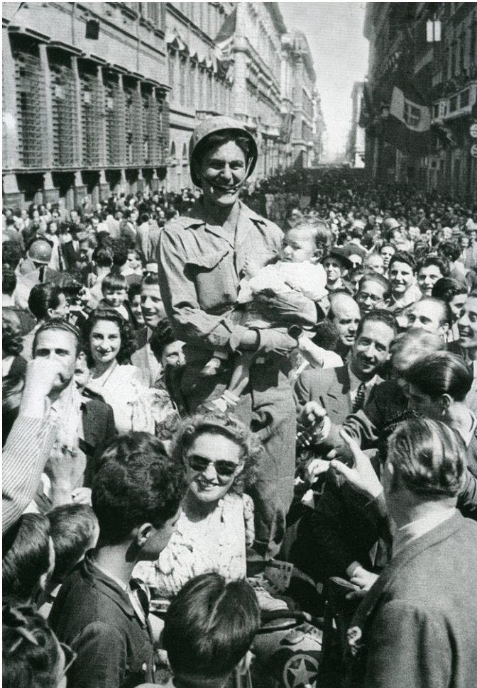
Romans greet the American liberators in Via Del Corso

One particularly joyful event was the liberation of Rome by American soldiers, in 1944. When U.S. troops came to free Rome from German occupation, after a few battles in the suburbs, security was established throughout downtown Rome. On June 4, 1944, the American soldiers entered Rome and paraded through the major downtown streets. My grandfather remembers many Italians greeting the soldiers, hugging them, kissing them and shouting gloriously. This impacted my grandfather very much since he felt, along with his family and all the other Italians, a sense of freedom. Now he could go freely to the Villa Borghese park, or walk fearlessly the length of Via Piemonte to his elementary school, without encountering the ever-present SS guards in front of the German SS Command on Via Piemonte. My grandfather explained with a chuckle that he thought the SS on the guards' helmets stood for the year 44 (It was 1944).