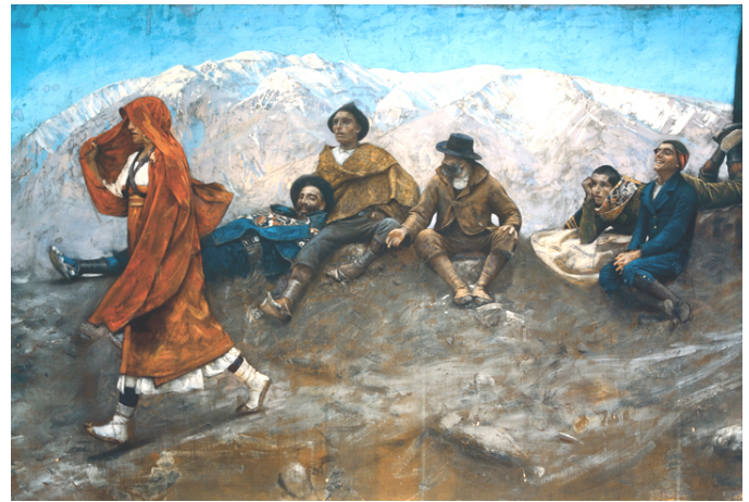
Daughter of Jorio - by Francesco Paolo Michetti

Francesco Paolo Michetti, whose paintings are also found in the town hall, learned the rudiments of painting from a local fresco painter. In 1868 he traveled to Naples, supported by a small grant to study at the academy there. Asserting that his temperament would benefit more from real-life situations, he was allowed to return to the Abruzzo region in 1869 and he continued to receive his grant. Michetti exhibited at the Paris Salons of 1872 and 1875, but he also belonged to Scuola di Resina, a group of Neapolitan painters that aimed to bring Italian art into Europe's mainstream. Abruzzo was his emotional and aesthetic inspiration. He captured its people, animals, and local events in emotionally charged paintings with luminous colors and vibrant light.