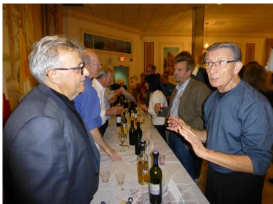
The November 2015 Wine Tasting Event

Location: Casa Italiana 595 Third Street, NW Washington, DC