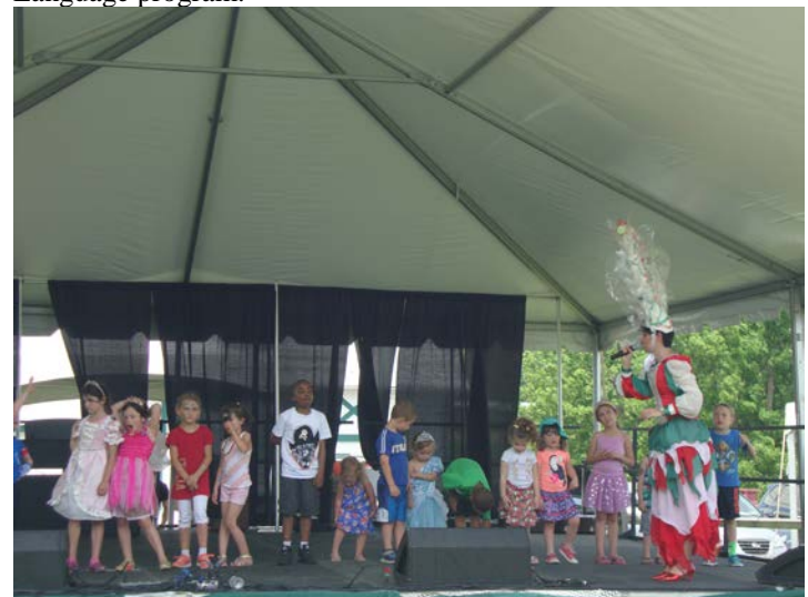
La Fata Italiana with the children