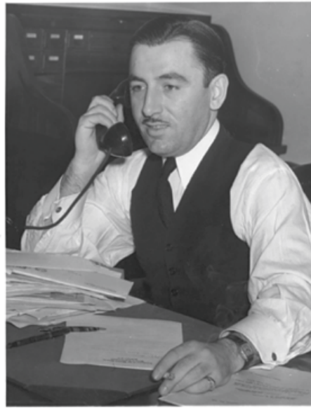
Thomas D'Alesandro, Jr. as a member of the U.S. House of Representatives.