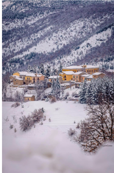
A winter scene in Cansano.

Chiesa di San Donato near the village cemetery was built in the 18th century. It is open only on the saint's feast day in mid-August. The new San Rocco Church built in the 1950s is located in Piazza XX Settembre.