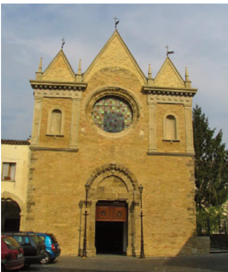
The Church of Santa Maria Maggiore.

In 412 A.D., Colleniso (Collenisus) became New Usconium and was encircled by protective walls in the Longobardo period. Afterwards, the most important fortification was raised in the 9th century, when Robert Guiscard took over the