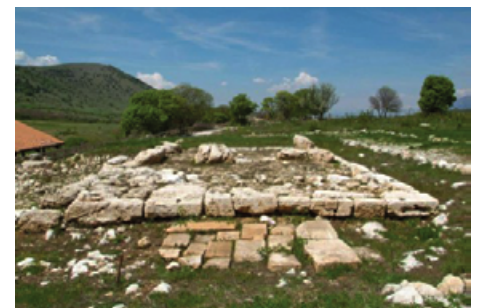
Temple ruins in the Ocriticum Archaeological Park.

On this site there was a settlement, a necropolis and a sanctuary, which had their greatest period of growth between the end of the 4th century BC and mid-way through the 2nd century AD. It was probably an earthquake in the 2nd century AD which damaged many of the buildings, thus starting a process of gradual abandonment of the entire area right up until the 6th century.