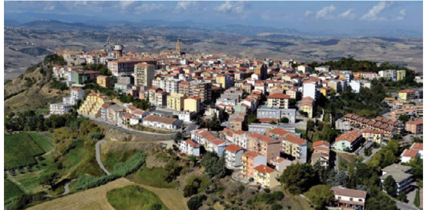
A panoramic view of Guglionesi.